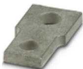
Connection element, number of positions: 2, color: silver

Connection element - HV M8/1 M6/1-STL - 3071094